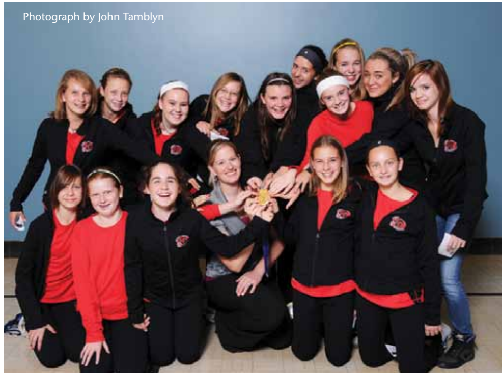
Gold medal winning Canadian hockey goalie Sami Jo Small shared her inspiring story of leadership on and off the ice with a packed auditorium, which included three London Devilettes hockey teams.

Stay tuned for more exciting opportunities to participate in iWIL events in the coming year.