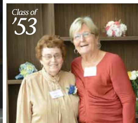
Class of '53