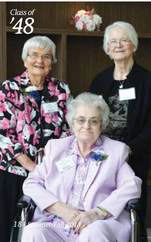
Class of '48