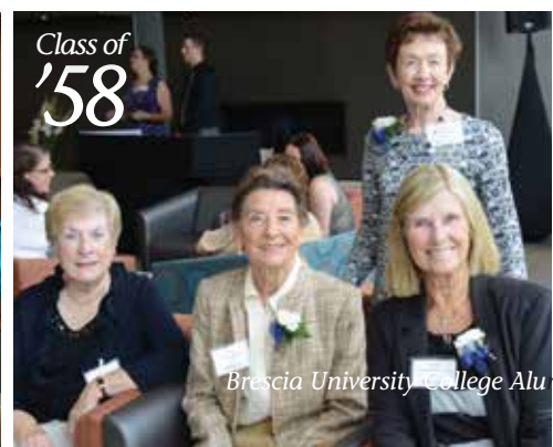
Class of '58