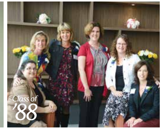
Class of '88