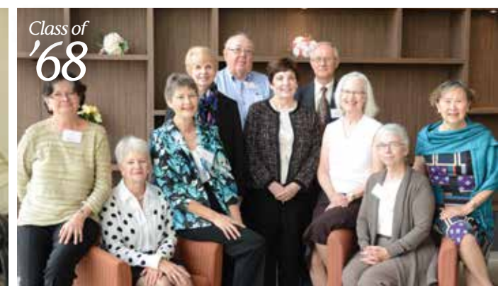
Class of '68