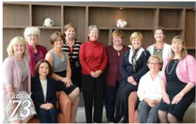
Class of '73