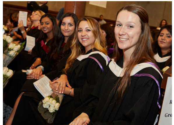
↓ PICTURED BELOW Graduands take part in Brescia's ring ceremony