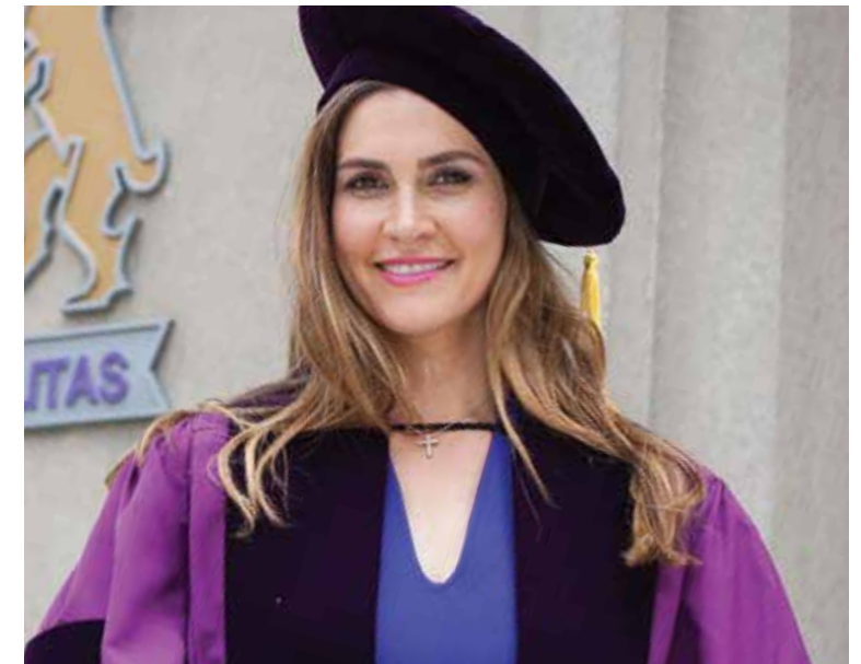
PICTURED ABOVE Nazanin Afshin-Jam MacKay