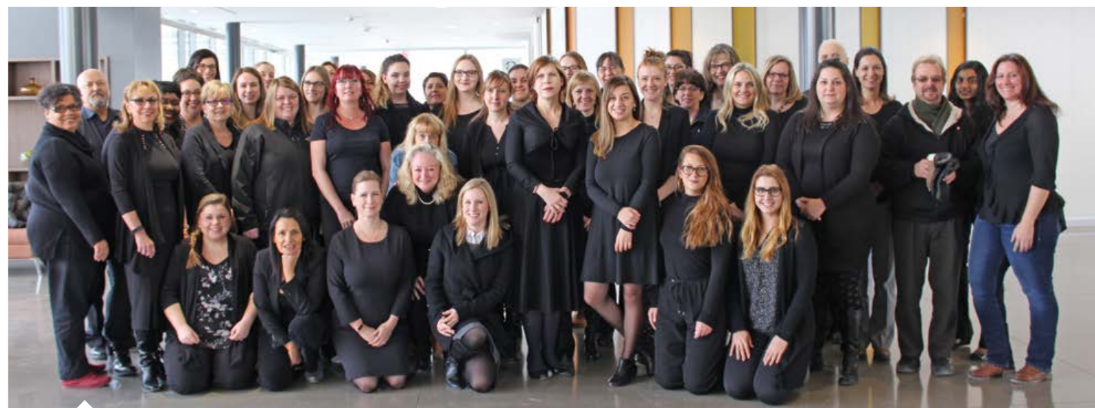
Faculty, staff and students came together to recognize the #TIMESUP movement in solidarity of women's empowerment in January.