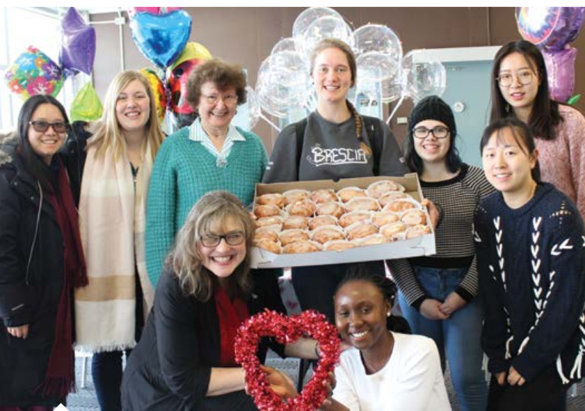
Student and Campus Ministry celebrating Shrove Tuesday in February.