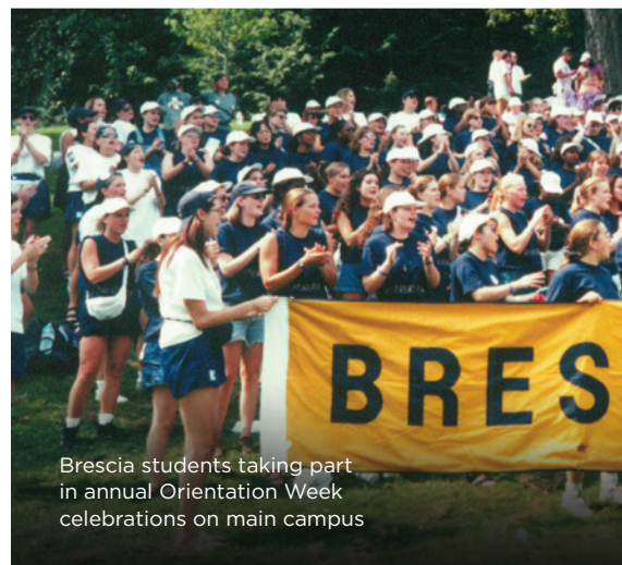
Brescia students taking part in annual Orientation Week celebrations on main campus