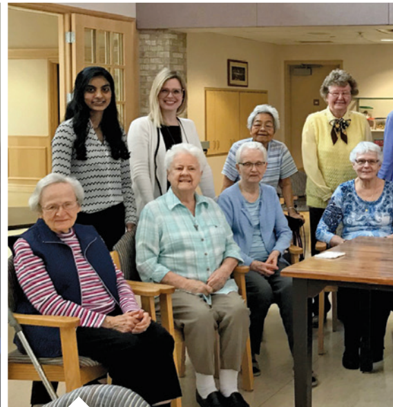
Brescia staff visited Villa Angela in Chatham on April 8 th and were lucky enough to hear many wonderful stories from a great group of Ursuline Sisters.