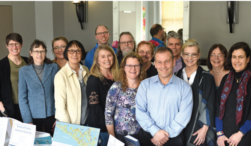
A celebration of bold research at the 2019 Faculty Author's Reception on April 11 th .