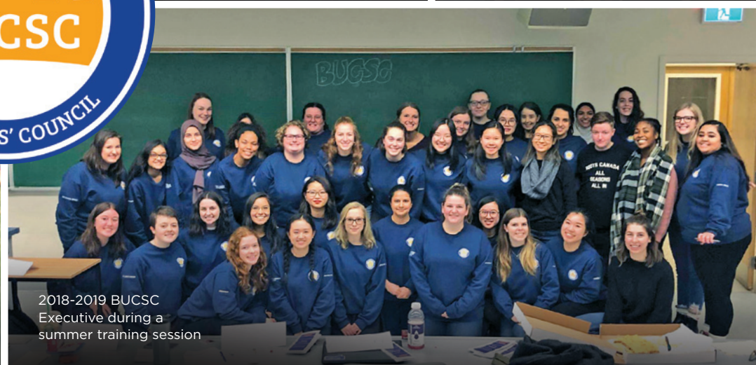
2018-2019 BUCSC Executive during a summer training session

One of the most significant issues during her tenure was the introduction of the Western Foot Patrol at Brescia. "The administration had some concerns, so we had to do our research and counter those concerns. In the end everyone was able to come together to make it happen."