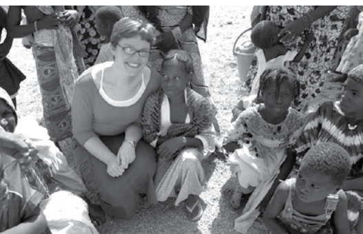
TOP: Afghanistan, April 2007. INSET: Working at a food distribution site in Niger during the food crisis of 2005.

Lindsay's home base is currently in Guelph, Ontario, but her passport and suitcase are never put too far away.