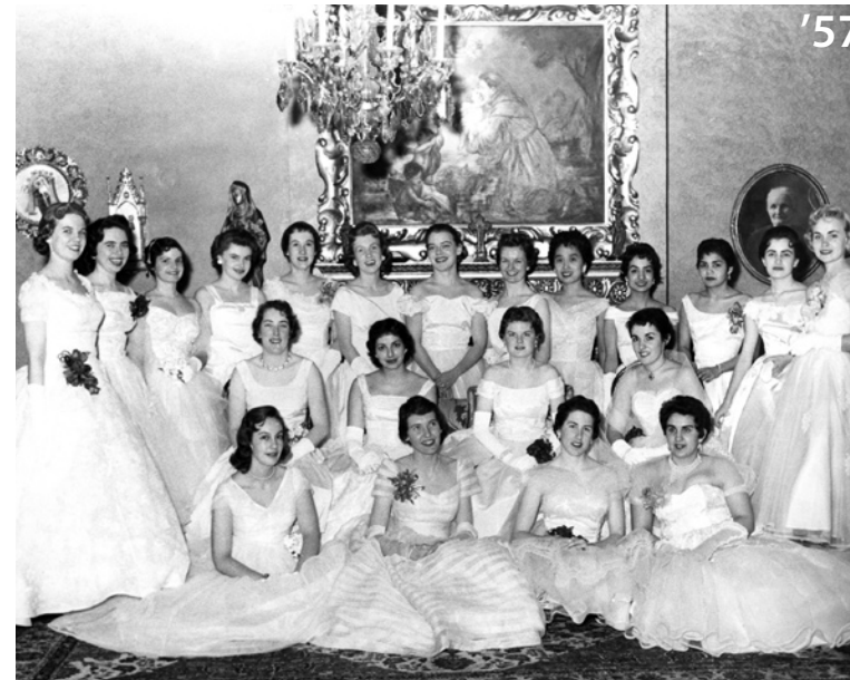
'57 Photo of the original class of 1957.

Visit www.brescia.uwo.ca/alumnae/events/homecoming.html for the latest details!