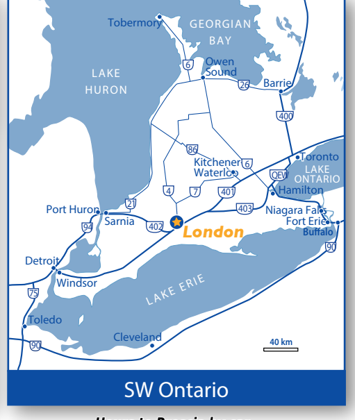
Hours to Brescia by car Ottawa: 7, Toronto: 2.5, Chicago: 7, Detroit: 2.5, New York: 9.5